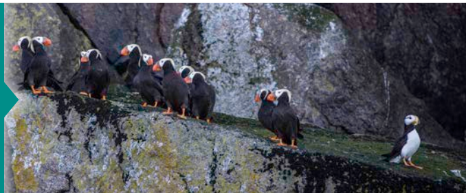
Tufted and Horned Puffins

One-of-a-kind adventures to the world's most fascinating places. Join us.