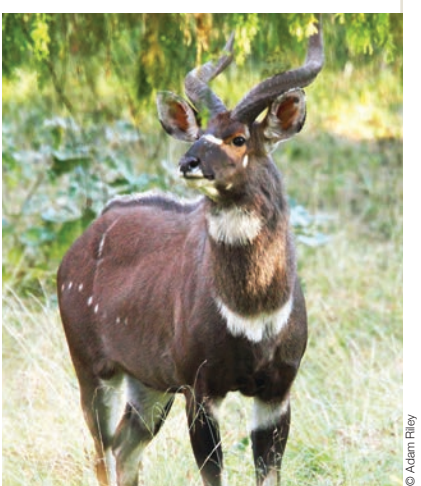
Photos: Great White Pelicans, Bale Mountains National Park, Ethiopian Wolf, Mountain Nyala.