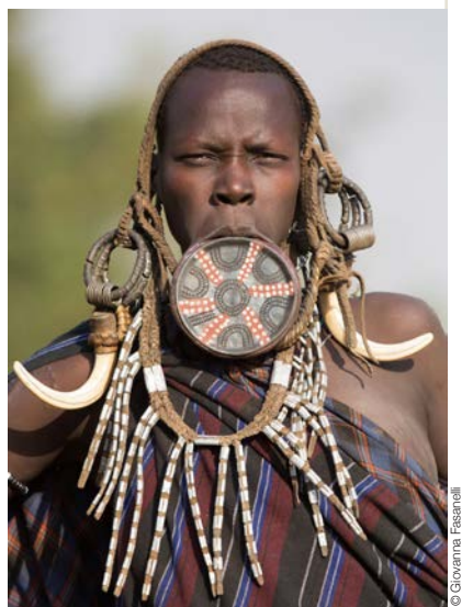
Photos: Yellow-billed Stork and Nile Crocodile, Hippopotamus, Key Afer Market, Mursi Woman.