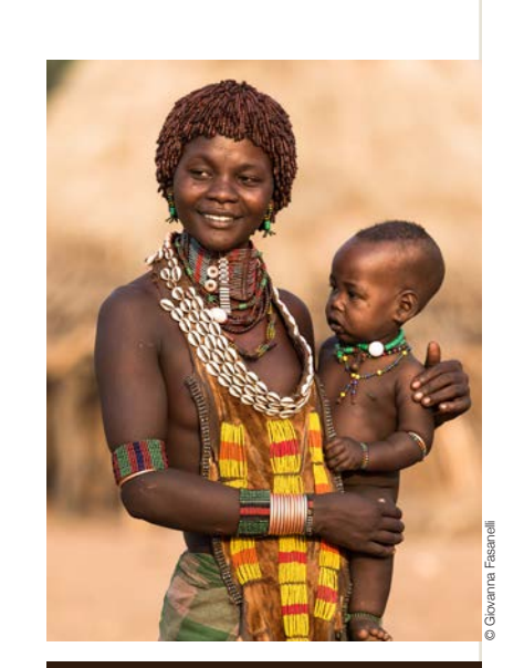
Photos: (Cover) Gelada, Church of St. George, Lalibela; Hamer Woman and Child, Southern Omo Valley.

At the cultural crossroads of Africa and straddling the Great Rift Valley, Ethiopia is an enigmatic land like no other. The continent's only country to have avoided Western colonization, it boasts a rare historical depth going back through medieval dynasties and the evolution of a religion to the reign of King Solomon. Awesome stone-hewn churches, medieval castles and great stelae all bear testament to this proud history, eclipsed in grandeur only by its landscapes. From the lofty peaks of the Simien Escarpment and its charismatic, endemic wildlife to the flamingo-studded soda lakes of the Great Rift Valley, from lake monasteries at the source of the Blue Nile to lip plates, scarification and body painting in the villages of the Omo Valley, this is raw Africa at its most dramatic and alluring.