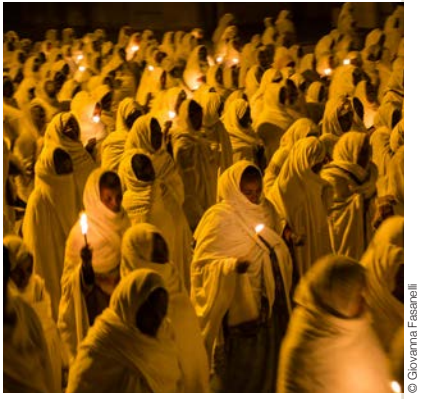
Photos: Simien Escarpment; Imperial Castle, Gondar; Priest, Lalibela; St. Mary of Zion Procession, Aksum.