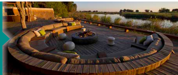
Kings Pool Camp

One-of-a-kind adventures to the world's most fascinating places. Join us.